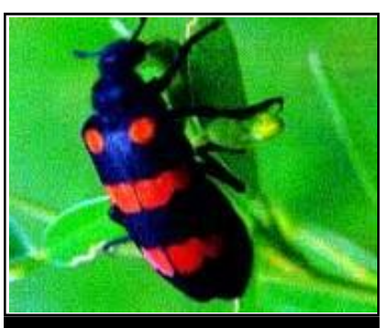
Fig. 5: Blister beetle