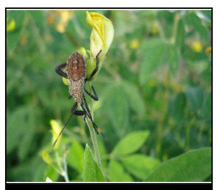
Fig. 4 : Pod bug