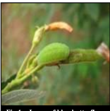
Fig 1 : Larva of blue butterfly

Planting of castor or tall sorghum/maize varieties on borders for conserving natural enemies.